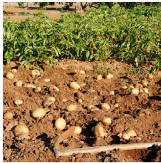
yields were the same for both the control and treatment